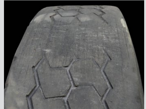
Brake Skid Damage